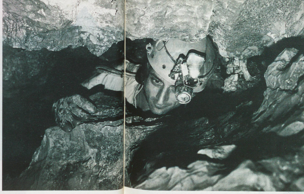
“It can be as narrow as you like down here – but nowhere do you feel so free”.

have to move over to the next rope hand over hand using a spring hook which you cannot open for ages because of your clammy, mud-covered hands. Thanks to the patience of the mountain guide we overcome this obstacle too.