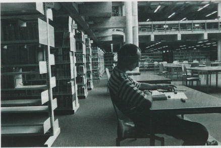
Specialised universities to open in 1997