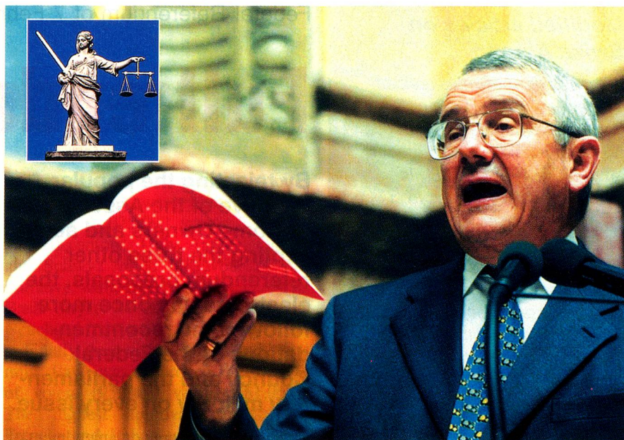
Federal Councillor Arnold Koller has laboured long and hard to present the amended Federal Constitution to the people. Justitia, the symbol of justice, served as a leitmotif in the implementation of the reform.