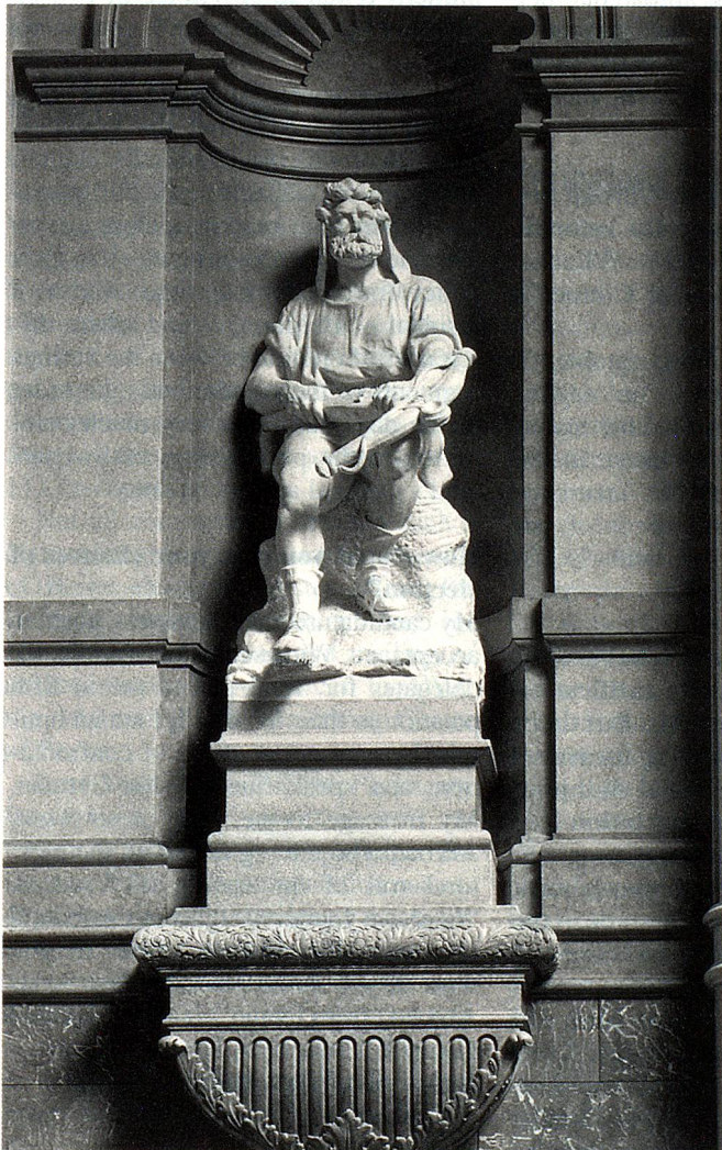
William Tell casts a critical eye on parliamentary proceedings.