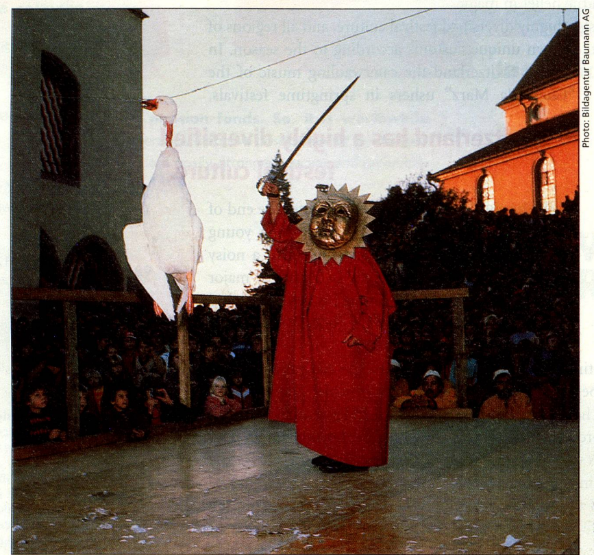
On St. Martin's Day Sursee celebrates the "Gansabhauet".

In the following articles, selected authors take a light-hearted look at the Swiss approach to celebrations and give an outsider's view of customs and traditions in a region of Switzerland they have come to know well.