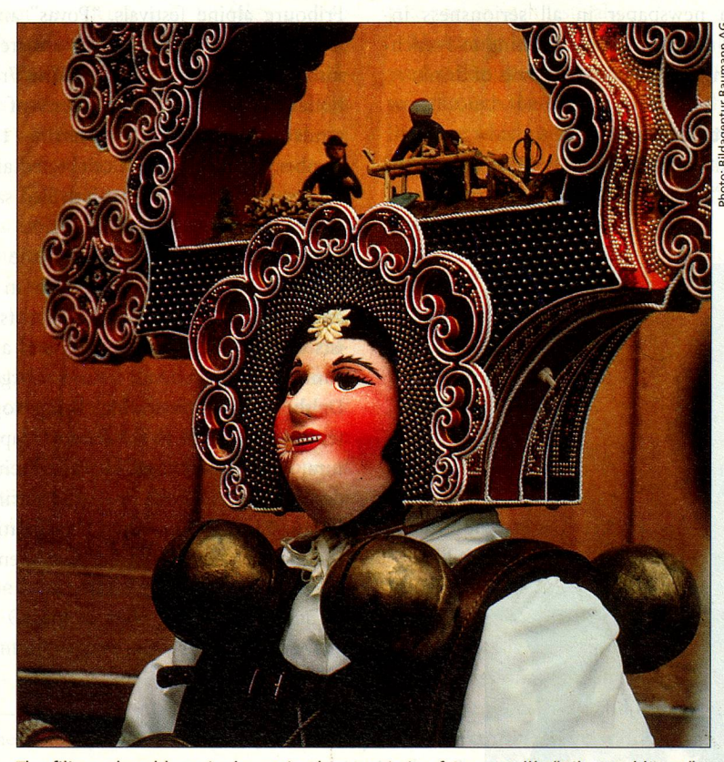
The filigree headdress is the main characteristic of Appenzell's "Silvesterkläuse".

This is the first impression of someone who finds themselves at festival drinking benches alongside German-Swiss swaying with arms linked and singing in unison. At times one feels a complete outsider. Yet at other times one feels in complete harmony, as when visiting the alpine festivals and country fairs which for centuries have played a major role in the annual cycle of rustic traditions. Once things have heated up at such events, the mood can become liberated and euphoric. Discourse is general and simple. At such moments one risks crossing the boundary between languages and cultures - and the reward is well worth while.