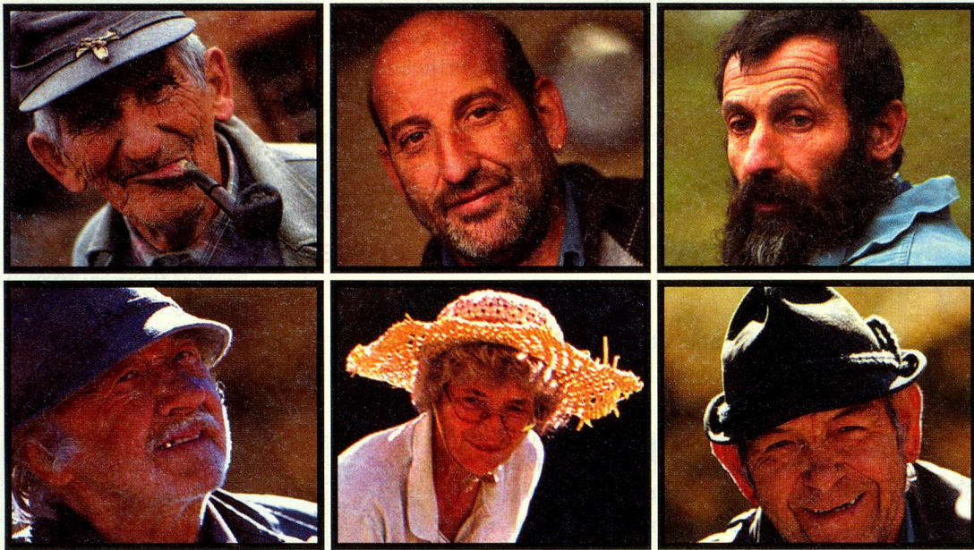
People with features carved in Wood.

The disappearance of state monopolies in the public services sector is making life difficult for remote regions. A closer look at our linguistic regions documents anxiety and concern among the population but also throws light on the innovative measures being taken to combat the threatened end of full-service coverage.