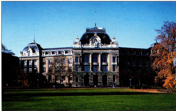
View of the main building of the University of Berne.

To be eligible for a university course, candidates must have a