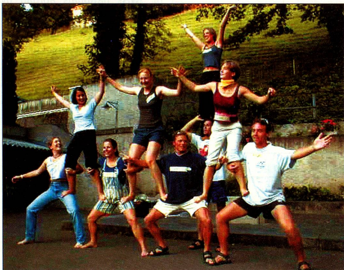
Fitness plays a key role in the Youth Service's active vacations.

The millennium offers of the Youth Service were a resounding success: an added incentive for us to continue with our concept of mix and match modules.