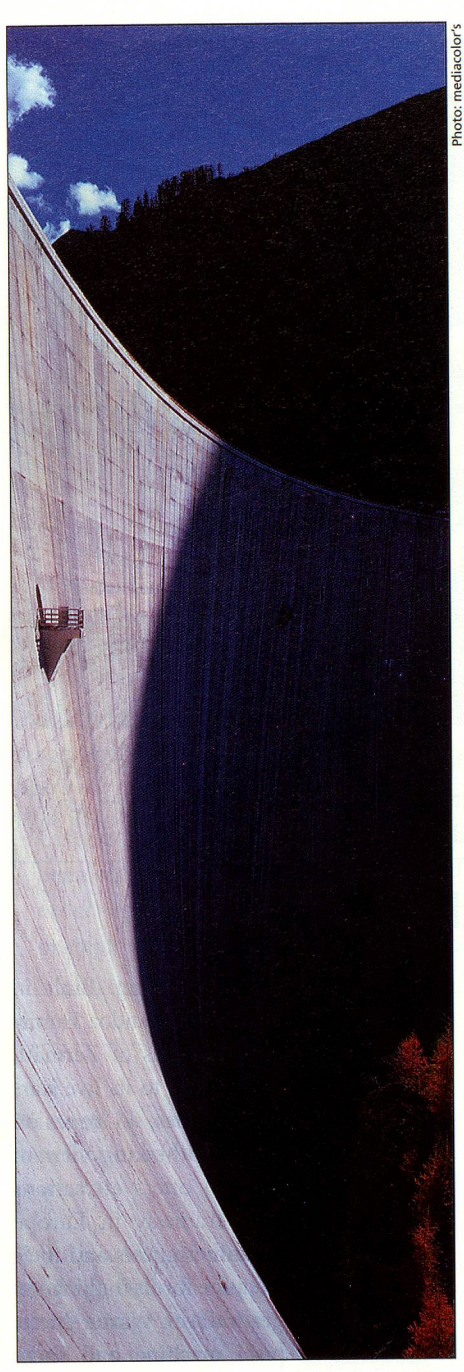
The government may grant loans to existing hydroelectric plants for renovations.

10 June 2001 23 September 2001 2 December 2001 Subjects not yet decided.