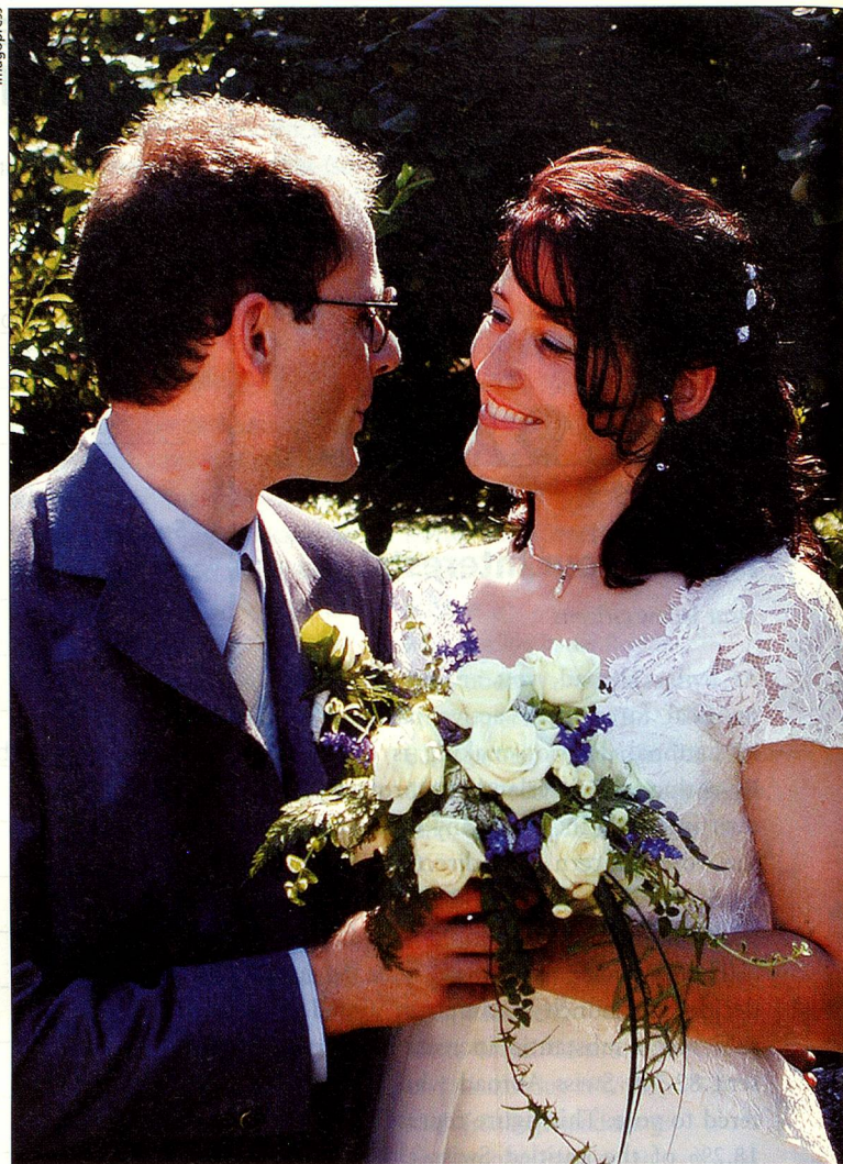
You can also tie the knot abroad. But there are several pointers to remember.

– If both spouses are Swiss nationals, both retain their cantonal and community citizenship. In addition, the wife is granted citizenship of her husband's canton and community.