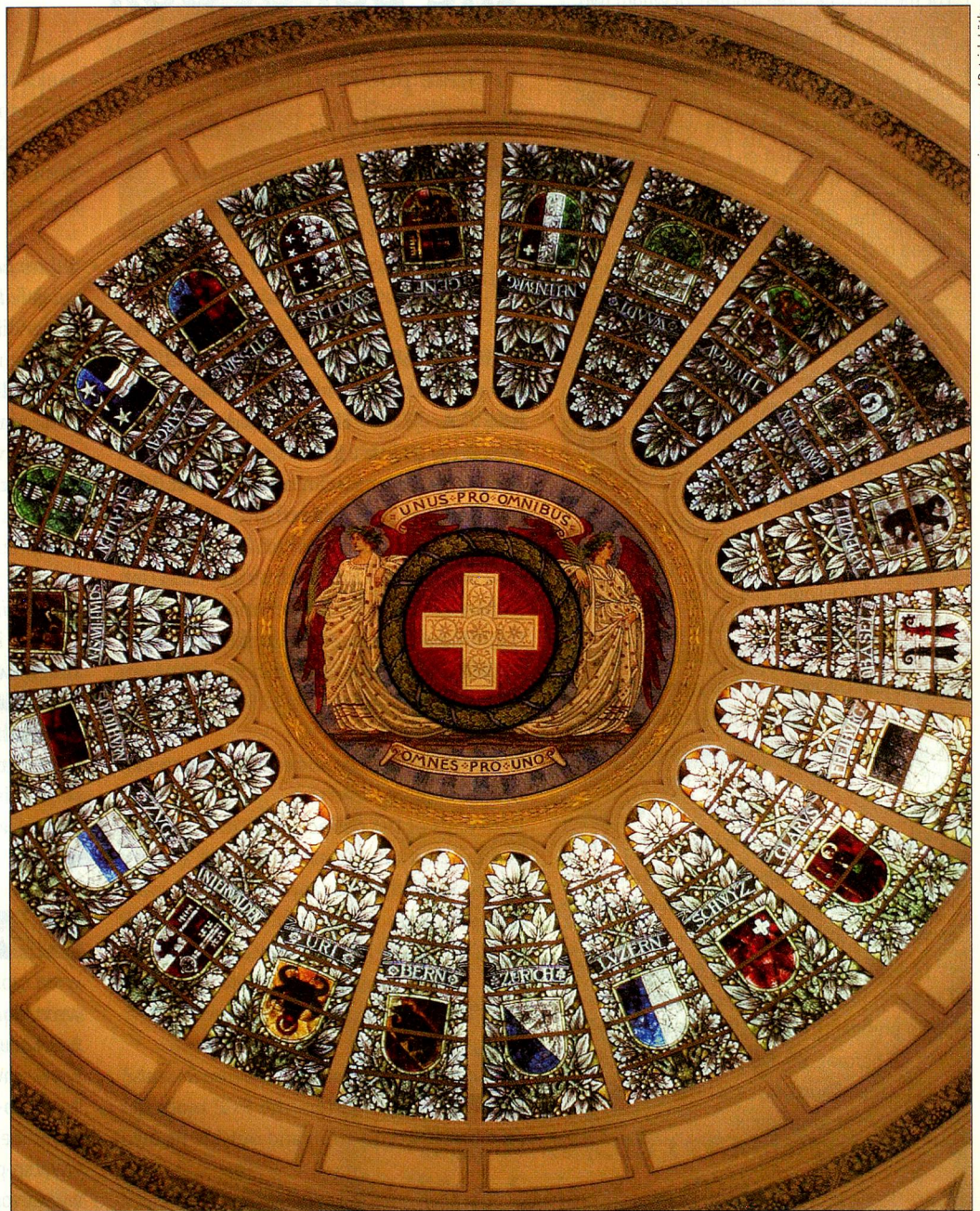
Interior view of the Houses of Parliament cupola with Swiss cross and cantonal coats of arms.

National Councillors are elected for a four-year period by proportional representation. The seats are distributed among the various parties in proportion to the number of votes cast in favour of the parties or their candidates. This way, minorities also have a chance of winning seats (unlike the majority or first-past-the-post system where minorities lose out; see below).