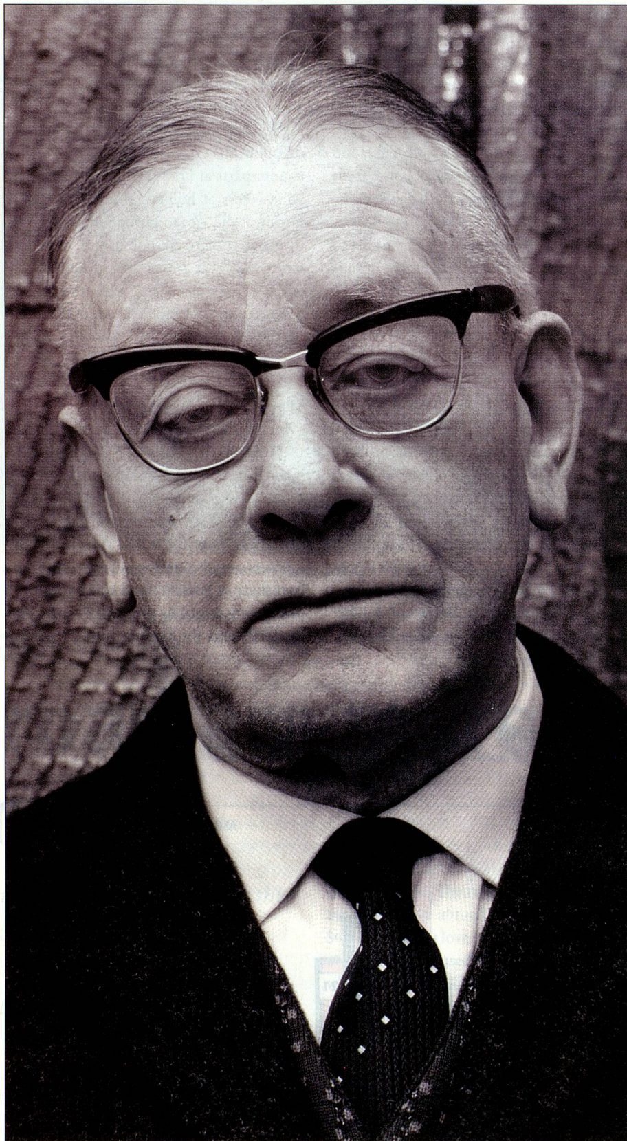
Paul Grüninger, the St. Gallen police chief who in 1938/39 allowed Jewish refugees to enter Switzerland in defiance of the regulations.

The best-known case of persons who were accused of crimes after saving the lives of thousands of Jews in 1939 was St. Gallen policeman Paul Grüninger, who was pardoned only in 1996 by the St. Gallen district court. In 1939 Grüninger was summarily dismissed and in 1940 was found guilty of dere-