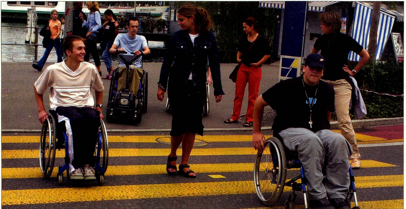
Swiss Centre for Paraplegics, Nottwil

Rehabilitation measures aim for substantial and sustainable improvement in employability.