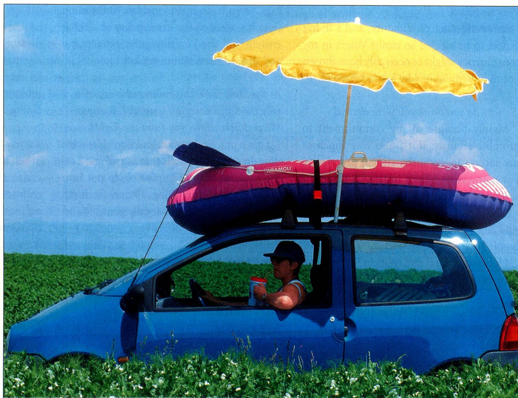
Getting the latest security updates on your holiday destination is just as important nowadays as loading the car correctly before you set off.