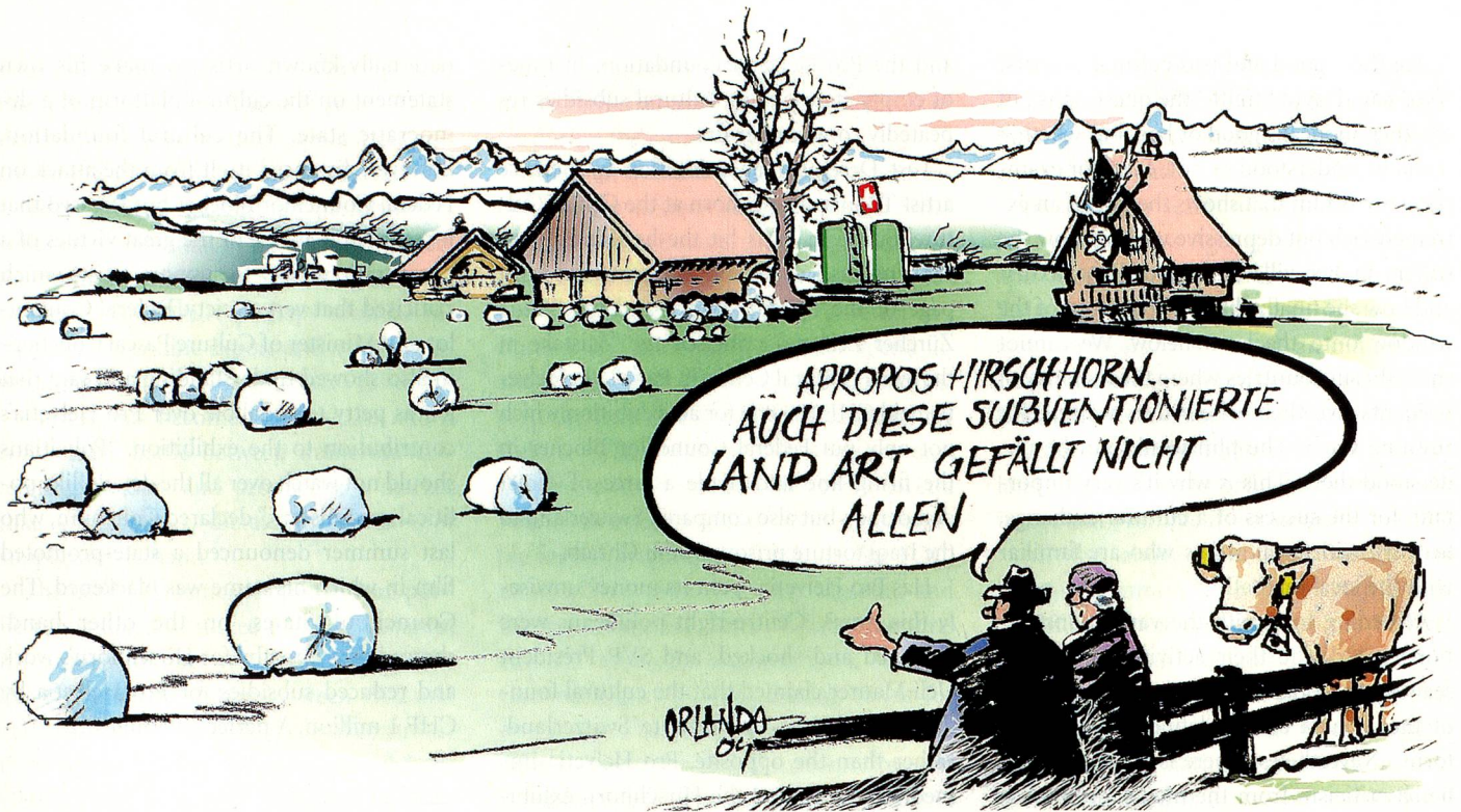
...Talking of Hirschhorn... This type of subsidised land art is not to everyone's taste either.