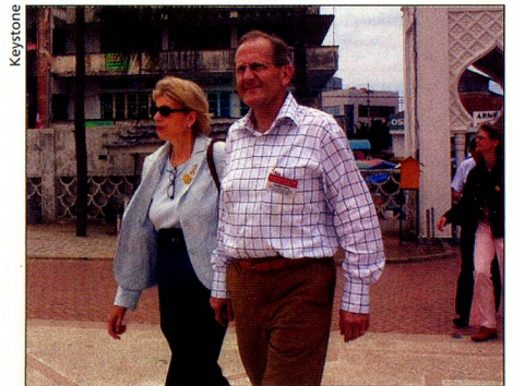
Swiss Federal Councillor Deiss (with his wife) on a visit to Indonesia.

22 April. Foreign tourism in Switzerland is on the increase. According to the Swiss Tourist Office their overnight stays rose by 1.7% in 2004, as against a decline of 2.8% in 2003. However, Swiss people spent less on overnight stays in their own country: the respective figures declined by 2.8%. The "markets of the future" for Swiss tourism are China, Korea, the USA, and the Gulf States.