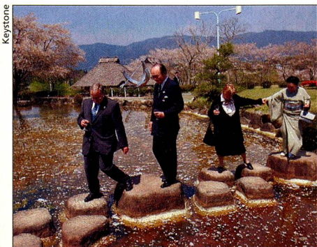
Federal President Schmid at the World Expo.

23 March. Opening of the World Exhibition in Aichi, Japan. Cultural Switzerland is not only content with the Swiss pavilion in the Land of the Rising Sun – since two years Pro Helvetia has been organising a rich cultural programme throughout Japan to present