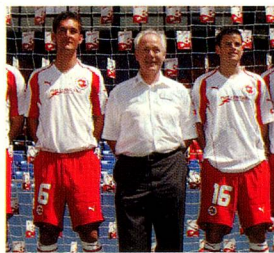
Köbi Kuhn, National Coach