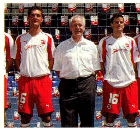
Köbi Kuhn, National Coach

We talked to national coach Köbi Kuhn, who is not only one of the best Swiss footballers of all time, but has also spent years successfully coaching young footballing talents in Switzerland. Talented young male and female Swiss Abroad (yes, the SFA also runs a training centre for young female footballers) who think they have what it takes to play for a junior national team, should contact the SFA in Berne as soon as possible to find out about the terms and conditions. Who will be the first Swiss Abroad to play in the Swiss national football team in a few years' time?