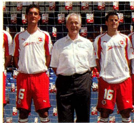
Köbi Kuhn, National Coach