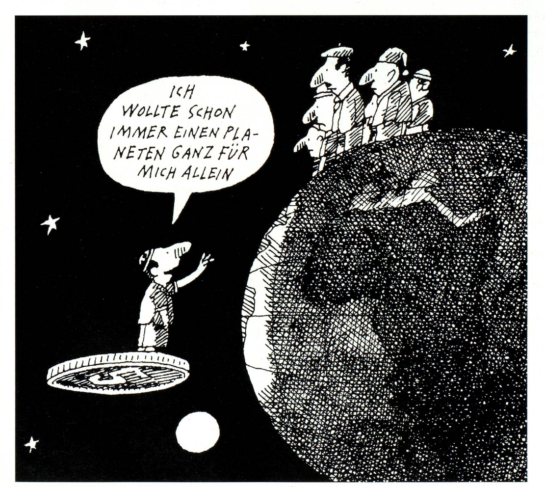
I always wanted to have a planet all to myself.

Meantime Foreign Minister Calmy-Rey maintains that "Peace policy is a lasting, effective instrument of neutral Switzerland which actively administers its responsibility with engagement and solidarity. The only genuine neutrality is active neutrality."