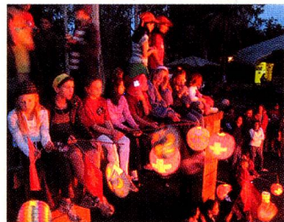
Bonfire at the Swiss National Day Celebration 2007 in Petrie, QLD