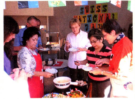
Swiss National Day celebrations in Maryborough