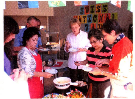
Swiss National Day celebrations in Maryborough