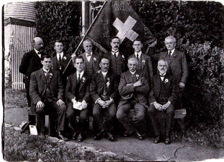
Some of our compatriots around 1914-1918