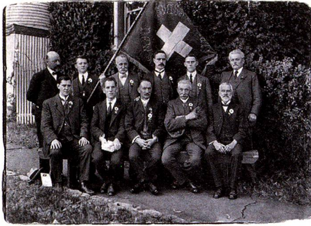
Some of our compatriots around 1914-1918