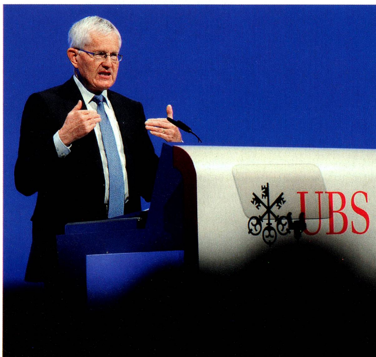
Chairman of the UBS Board of Directors, Kaspar Villiger, is trying to win back the trust of its customers.

Shortly afterwards, the American tax authorities brought a civil action against UBS in Florida demanding that it reveal all 52,000 names of US customers whose assets managed by the bank total almost USD 15 billion. It looks likely that UBS will be in the dock in Florida in mid-July. "UBS' fate will be decided in Florida. A victory for the tax authorities would break the bank's neck. The bank's core business, asset management, would be hit badly" (so writes the "NZZ am Sonntag"). "Berne" and the bank are now hoping that the (wealthy) American customers suspected of tax evasion will turn themselves in to the US tax authorities.