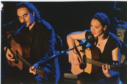
Leading the way: Stephan Eicher and Sophie Hunger