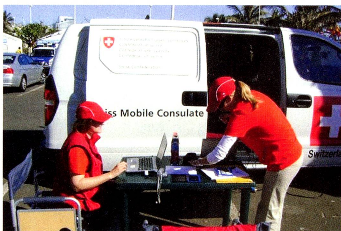
The Swiss Mobile Consulate in action.

Experience the Flamenco soul on the way to ZURICH