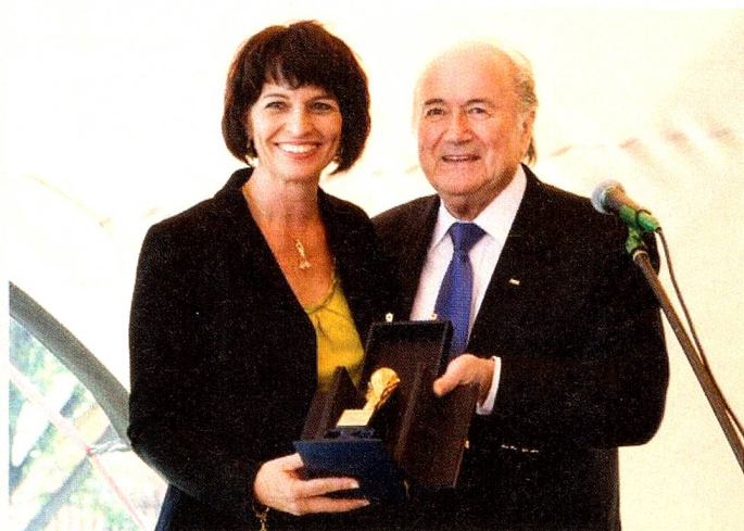
Doris Leuthard and Joseph Blatter

As guest of FIFA, the President of the Swiss Confederation, Doris Leuthard, accompanied by her husband, travelled to South Africa to attend the opening ceremony of the 2010 FIFA Soccer World Cup.