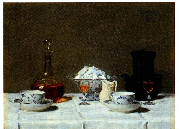
«Tee und Cognac». In his still life paintings, Albert Anker draws inspiration from 200 years ago and the master Jean-Baptiste Siméon Chardin.