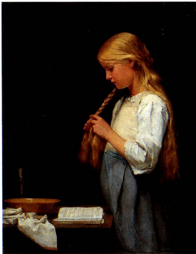
«Mädchen, die Haare flechtend». Anker gives equal attention to the book, cloth and plait: not fastidious realism but an inclination towards the everyday things in life.

This made his success even more significant. Anker was able to exhibit at the much-coveted "Salon", whereas Manet, Degas and Monet were rejected. He lived in Paris in the winter months, he was well versed in topics ranging from Plato to Darwin and he spoke French with his friends. In the summer, he lived and painted in his grandparents' house in Ins, popular and revered. His genre paintings were in keeping with contemporary tastes. In the emerging federal state, Anker-