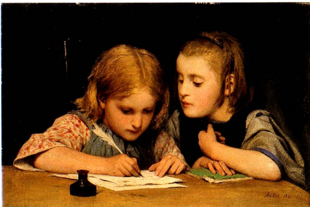
«Schreibunterricht II». Learning to write is not an easy task and certainly no idyll.