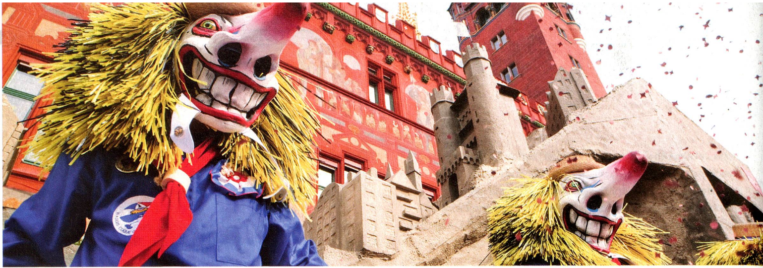
Carnival in Basel, Basel Region