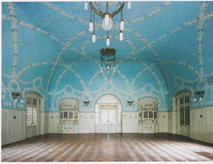
The dining- and ball room of the Bergün casino which opened in 1906, photographed by Ralph Feiner in 2009

The exhibition: until 12 May 2013 at the Grisons Museum of Art in Chur. www.buendner-kunstmuseum.ch The book: "Ansichtssache", 150 Jahre Architektur-fotografie in Graubünden. Edited by Stephan Kunz and Kobi Gantenbein; Verlag Scheidegger & Spieser/Bündner Kunstmuseum, 384 pages; CHF 58, EUR 48.