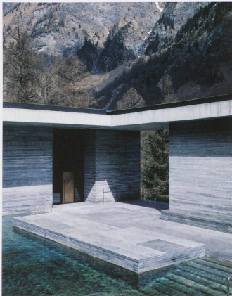
The newly built Vals thermal baths, designed by the architect Peter Zumthor, opened in 1996