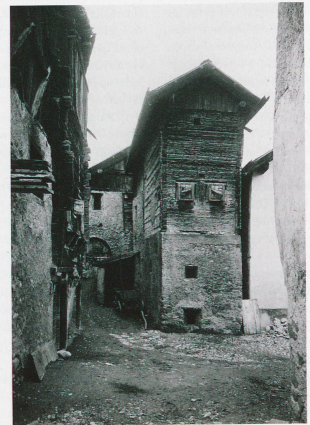
House in Zuoz photographed by Rudolf Zinggeler

SWISS REVIEW April 2013 / No. 2 Photos: Ralph Feiner, Kobi Gantenbein