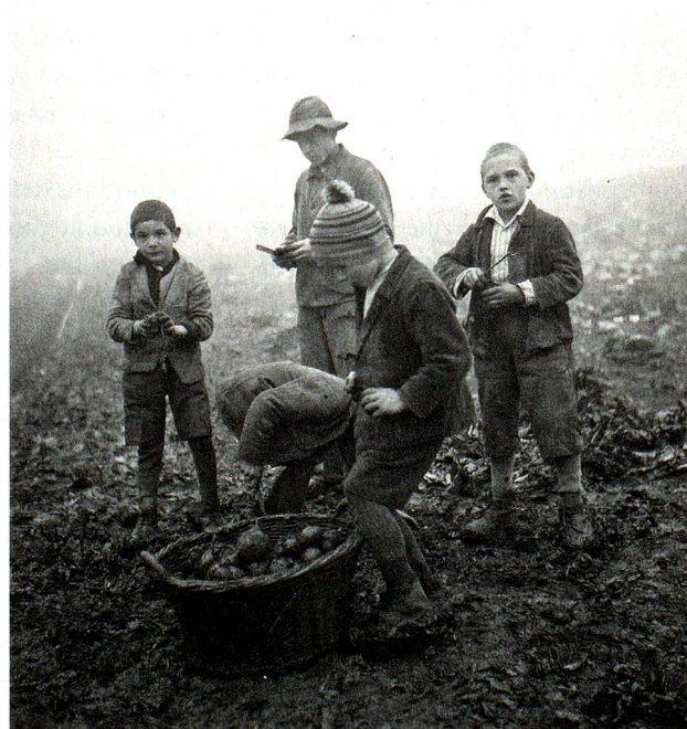
Photographs of contract children taken by Paul Senn in the 1940s, on display at the “Verdingkinder reden – Enfances volées” exhibition being held at various local