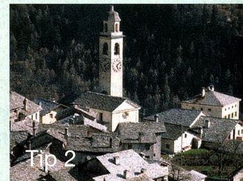
MySwitzerland.com Webcode: A147088

Val Bregaglia, south of Graubünden, is a paradise for hikers and climbers, but it is also a source of continuing inspiration for numerous artists. This idyllic valley is where the famous Alberto Giacometti spent his early years.