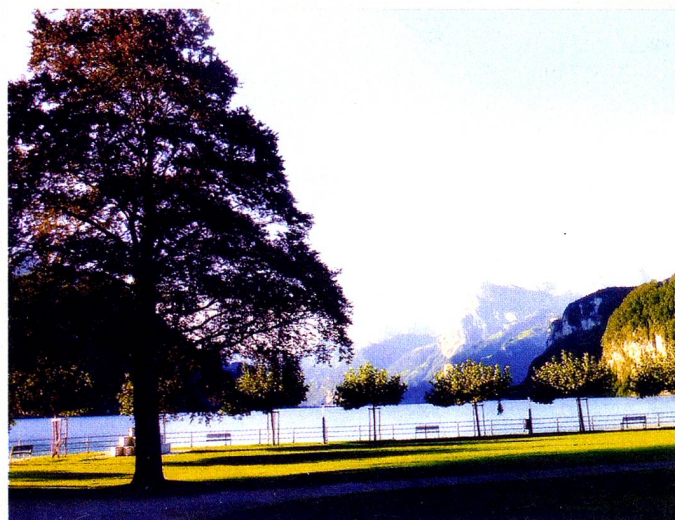
Fighting to retain the value of the Auslandschweizerplatz in Brunnen