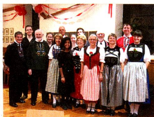
Unterhaltungsabend @ the Swiss Club

Trachtengruppe Schwyzgruess / Australian Swiss Cultural Soc. (contact Silvia Hochuli - as above)