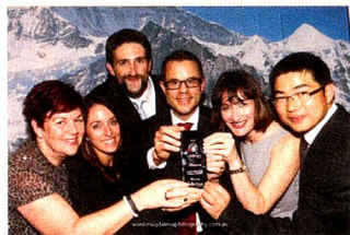
Hilti - Winner Swiss Award Australia 2014

18/6 "EuroMix" Eat, Meet & Greet, Syd 10/9 Eat, Meet & Greet, Melbourne 13/10 Swiss Ambassador Cup, Melb