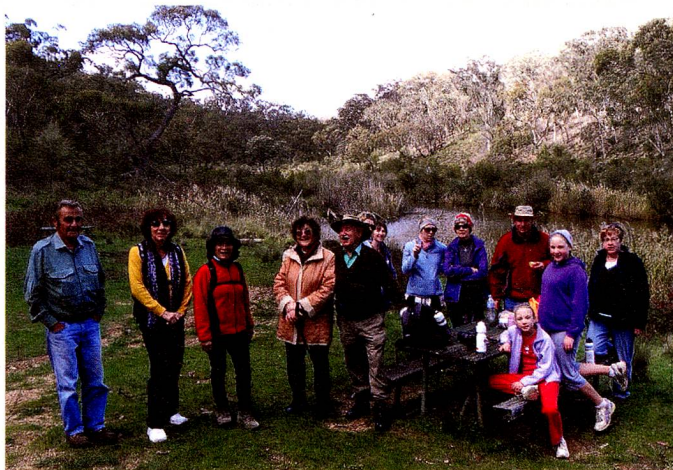
Bushwalkers rest - Canberra Swiss Club