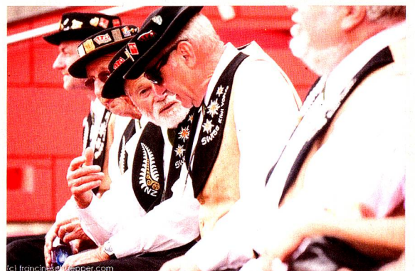
Impressions Swiss Festival 2014, Melbourne