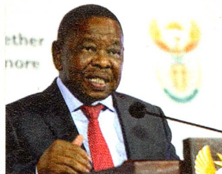
South African Higher Education and Training Minister Blade Nzimande

the whole private sector to follow in the footsteps of the Swiss Chamber of Commerce," Nzimande said.