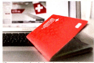
The new Auslandschweizer-Gesetz has been ratified

minimum of 20% Swiss scholars at Swiss Schools outside Switzerland. There is however a new clause, that such Swiss Schools have to admit scholars with a Swiss passport.