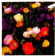
Floriade in Canberra