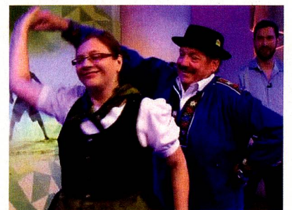
Swiss Dance off

We thank the embassy for their support in providing red caps for us all and soccer jerseys to borrow.