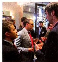
SwissCham EuroMix Eat, Meet & Greet in Sydney and Melbourne 10 & 17 Sept 2014

Book Cover 'Swiss Alps to Antarctic Glaciers', launched at the Swiss Club of Victoria on Sep 11.