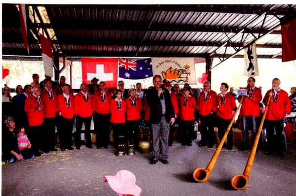
Swiss Yodlers of Sydney

On 29 November, we will perform at the Senior's lunch at the Concordia Club in Tempe.