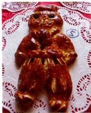
Samichlaus with Grittibänz, Fraser Coast