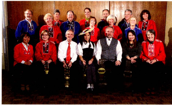
'Crèmeschnitte Chörli' Canberra Swiss choir

Spring in Canberra is an exciting time for soul and mind. It marks the end of winter and gives way to a season full of colours in 'Floriade', the flower festival bringing new life into the city. This is a fabulous time of the year. But that's not all, we have more reason to celebrate. The German Choral Festival 'Sängerfest 2014' is held for the first