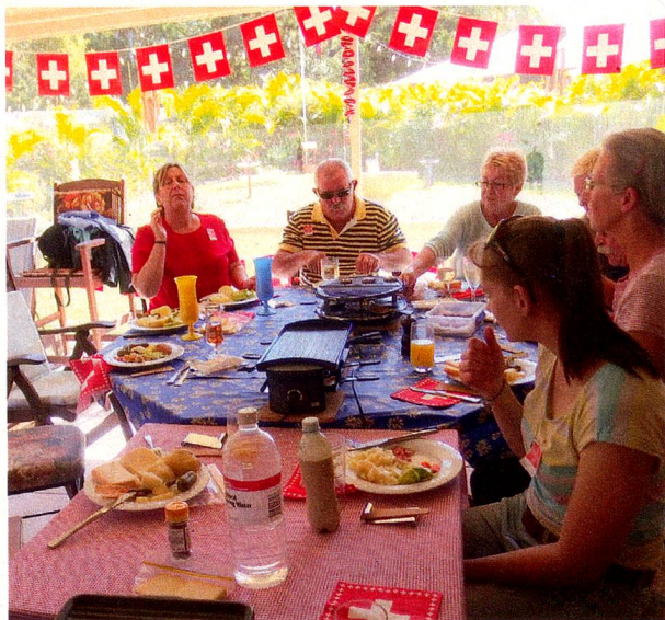
Swiss Raclette, Fraser Coast