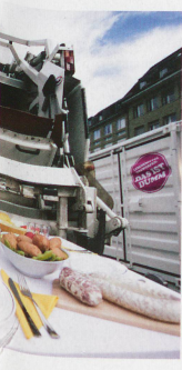
Around a third of Europe's food ends up in the bin. Photo from the "food waste" exhibition in Basel

at least open the lid: "In all likelihood, it will still be perfectly good."