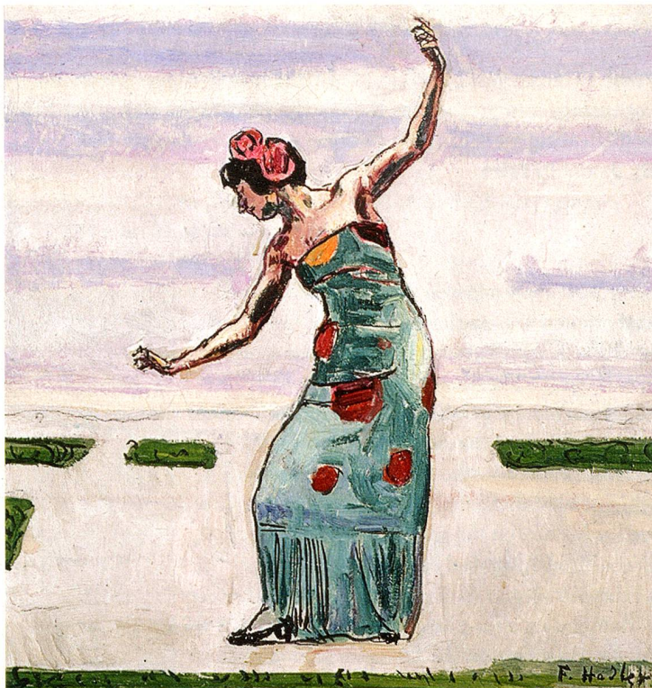
A typical work of art from the period: the "Tänzerin" (Dancer) by Ferdinand Hodler

claimed book "Der taumelnde Kontinent" (The Vertigo Years), which is a vivid and opulent cultural history of the period prior to the First World War. It provided the model for the exhibition in Zurich. Anyone who has not read the book can now step into it, so to speak. And anyone unable to travel to Zurich can enjoy the same experience as a reader - an unconventional, extraordinarily colourful and compact collection of impressions about a turbulent time which cannot be overlooked and is fascinating precisely for that reason.