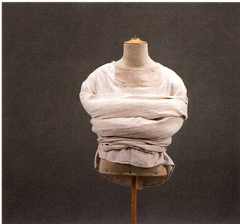
A straightjacket from the Waldau psychiatric hospital near Berne

like Friedrich Engels, a social theorist and close friend of Marx, who had foreseen a “world war of unprecedented scale and severity” as early as 1887: “eight to ten million soldiers will slaughter one another”.