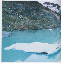
The Gault Glacier in the canton of Berne and in the background the Bârglistock bathed in the morning light