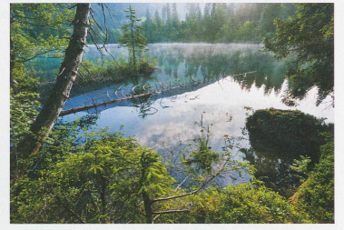
The Crestasee near Flims in the canton of Grisons