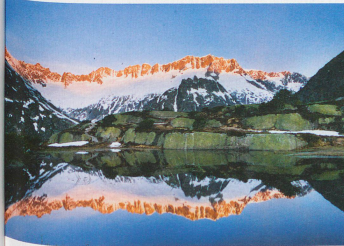
Göscheneralp in the canton of Uri with the peaks of the Damma mountains in the background