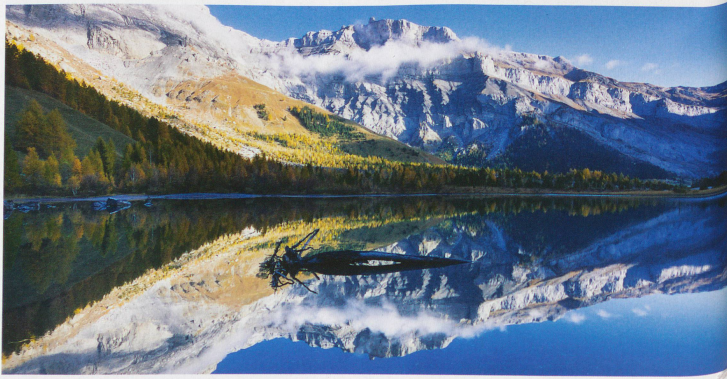
Lac de Derborence in the canton of Valais with the Tour Saint-Martin crag, also known as the Quille du Diable (Devil's Skittle)