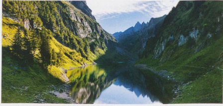
The Filensee in the canton of Appenzel innerrhoden with the peak of the Altmann in the background