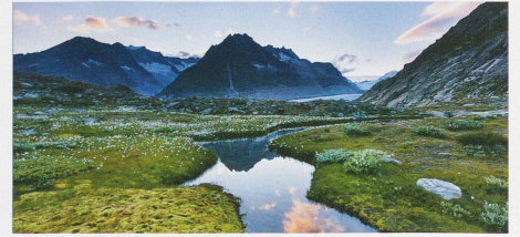
The tributary that flows into the Märjelensee at the edge of the Great Aletsch Glacier in the canton of Valais