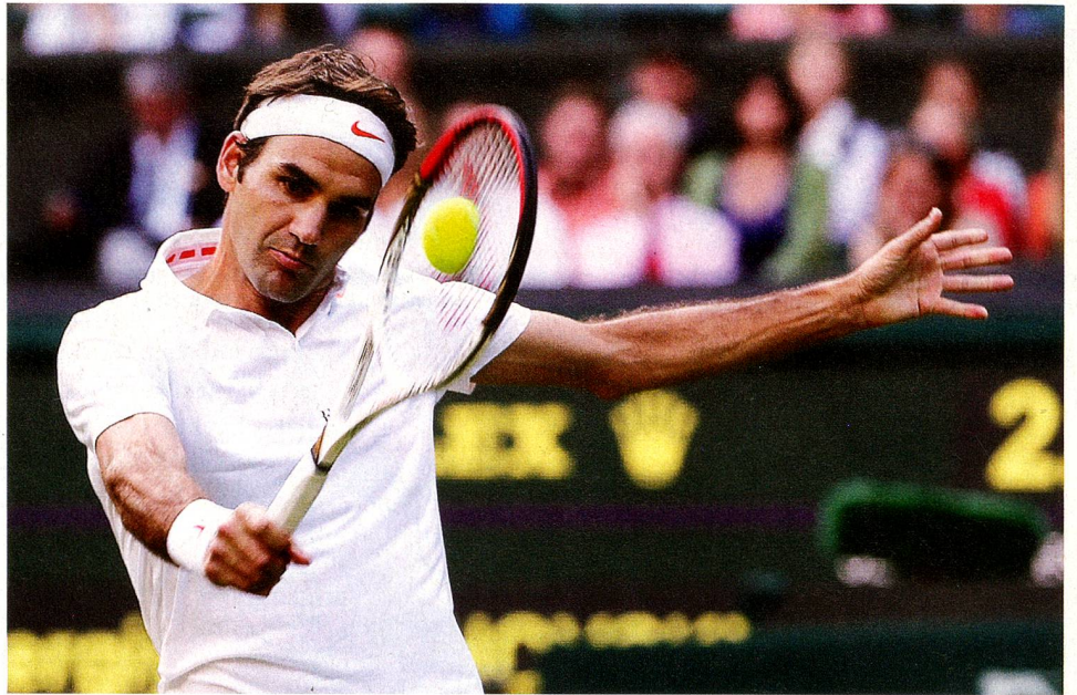
Roger Federer at Wimbledon in 2013

When selecting sponsors, Roger Federer displays his typically well-balanced approach. Of the ten equipment suppliers and sponsors – leaving aside the international brands of Rolex and Credit Suisse – three come from Switzerland: Lindt, insurance company Nationale Suisse and household appliance manufacturer Jura. The question as to whether a company that makes irons is too mundane a partner for an illustrious