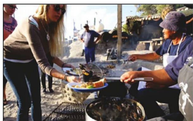
Culinary journey through Cape Town

If you ever feel South Africa is not the coolest place on earth, just take a look at what these Swiss tourists experienced in their travels through the Western Cape. The video “Food Safari Cape Town – Where Food Lovers Dreams come true”