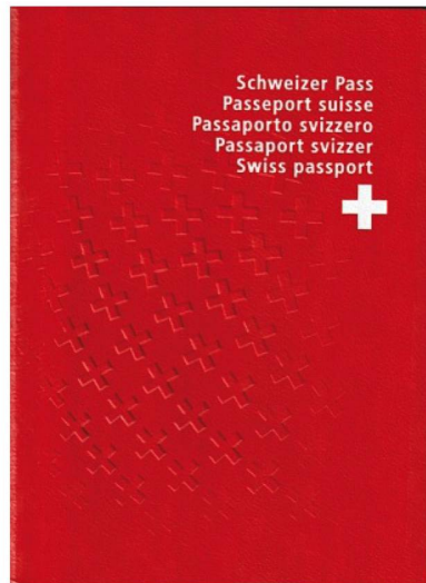
An appointment is required to apply for a new Swiss passport.

To apply for a new passport, applications have to be submitted on www.schweizerpass.ch . Once the application is verified, you will receive an e-mail with a link which gives you access to our calendar. A suitable date and time can then be chosen for an appointment. During the appointment, the biometrics as well as a photograph for the Passport and identity card will be taken. Children must be accompanied by both parents. This procedure can be also done during your visit in Switzerland at any Swiss passport offices. However as most of the Swiss passport offices have a waiting list, we have to contact the passport office in Switzerland before you can make an appointment.