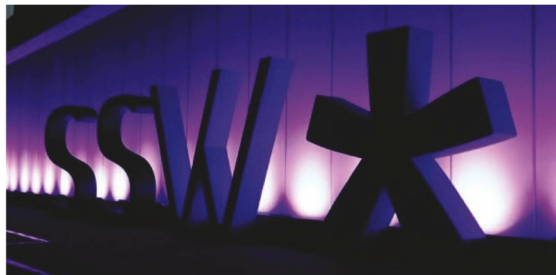
Seedstars connects startups from emerging markets with investors