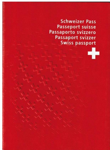
An appointment is required to apply for a new Swiss passport.

To apply for a new passport, applications have to be submitted on www.schweizerpass.ch . Once the application is verified, you will receive an e-mail with a link which gives you access to our calendar. A suitable date and time can then be chosen for an appointment. During the appointment, the biometrics as well as a photograph for the Passport and identity card will be taken. Children must be accompanied by both parents. This procedure can be also done during your visit in Switzerland at any Swiss passport offices. However as most of the Swiss passport offices have a waiting list, we have to contact the passport office in Switzerland before you can make an appointment.