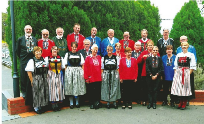
Victoria: Companion Singers and the Swiss Folk Dance group together at the nursing homes

the Companion Singers performed in nursing homes in November as an early Christmas present.