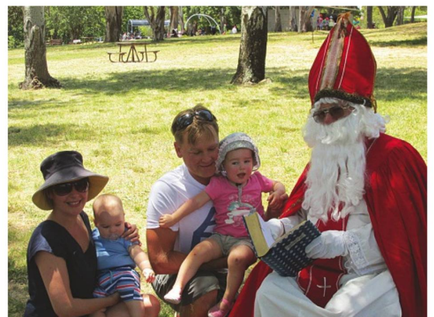
Santa in Canberra

Hopefully you all had a good start into the New Year. Our first event will be a Film night in February. For several years we have been privileged to join the Swiss Jodlers of Sydney on their harbour cruise, so hopefully this year too. Also in February, the Multicultural Festival takes place in Canberra. Usually on Saturday the Swiss and German Radio Programs have a time slot where they broadcast live from the Festival. In March traditionally the Club spends the weekend at the coast.