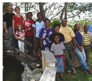
PNG: Members of the AIDS Work Team

by dedicated Swiss Mission pioneer missionaries has developed into a professional health service we can be proud of run by nationals.