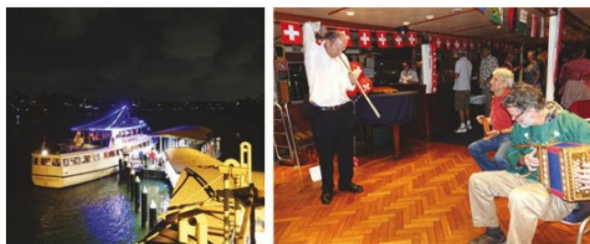
Yodlers Harbour Cruise