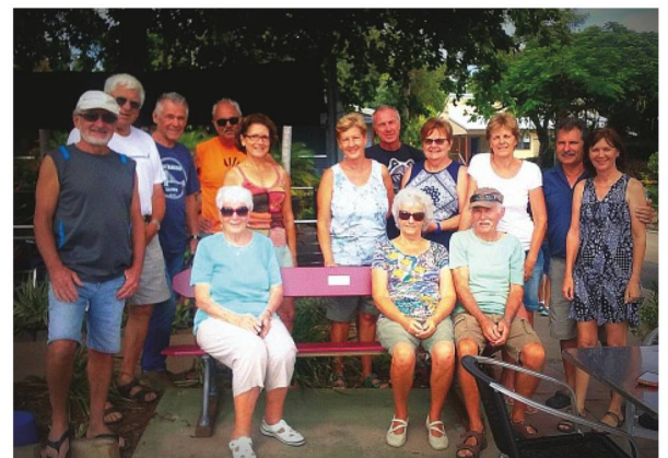
Woodgate Beach Camping, Sunshine Coast Swiss Club