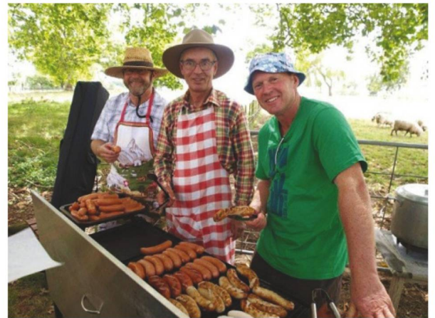
on Queens Birthday.

CONSULATE GENERAL OF SWITZERLAND IN SYDNEY (FOR AUSTRALIA, KIRIBATI, NAURU, VANUATU & SOLOMON ISLAND) 101 GRAFTON STREET, CNR GROSVENOR ST TOWER 2, LEVEL 23 , BONDI JUNCTION, NSW 2022, AUSTRALIA PHONE: 0061 2 8383 4000 E-MAIL: SYD.VERTRETUNG@EDA.ADMIN.CH WEB: WWW.EDA.ADMIN.CH/AUSTRALIA