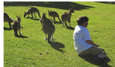
Canberra Swiss Club March long weekend

We also seek your input into our 50th birthday celebration next year. Do you have a memory or story to share? Any ideas how we can celebrate? Your input is much valued! Now we look forward to see you at our bush walk first Sunday in May or at the Fondue in June