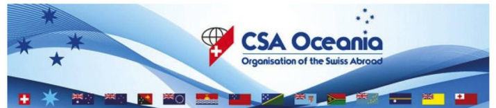
Please check out the new website of Council of Swiss Abroad: www.csa-oceania.org