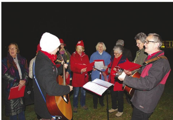
Canberra Swiss Club: Choir and guitar performance @ National Day Celebration