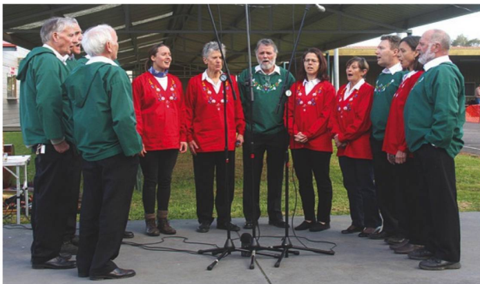
Matterhorn: New faces at the Swiss National Day celebration in Melbourne