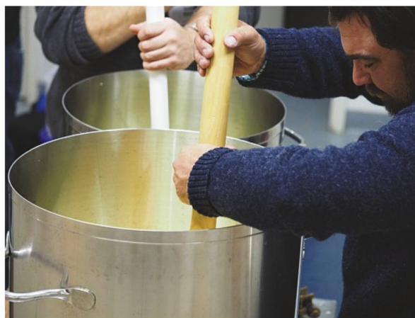
Canberra Swiss Club: Fondue night