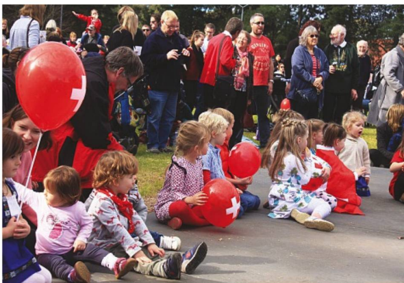
Matterhorn: youngest members of the community enjoying the day