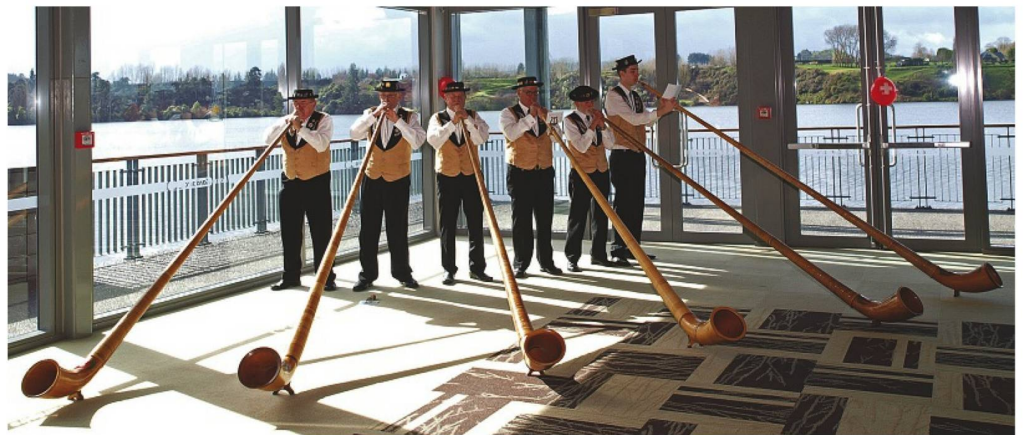
Alphorn players Hamilton

Hamilton's National Day Celebrations were held in conjunction with the 60th Jubilee Celebrations. 200 people helped celebrate this wonderful occasion at the Lake Karapiro Domain. It was great to see so many new faces – a lot of people who had connections to Swiss descendants from many years ago. The Swiss-Kiwi Yodel group treated us to some beautiful yodelling and alphorn playing and the Ambassador gave a very informative speech. There was an amazing selection of prizes on the raffle table and everyone was treated to a nice buffet lunch and dessert.