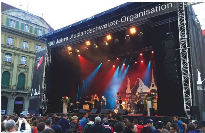
100 years ASO celebration with concerts and activities on the Bundesplatz in Bern

This year, the CSA meeting and OSA congress was particularly interesting. The OSA was celebrating its centenary with a remarkable program. There were concerts on Friday evening and the whole Bundesplatz was dressed in OSA colours. Many information stands and lots of happy people enjoyed what the expat community had on offer. Different groups were presenting themselves and sharing their experience and knowledge. The speech of Bundesrat Didier Burkhalter was also very inspiring.