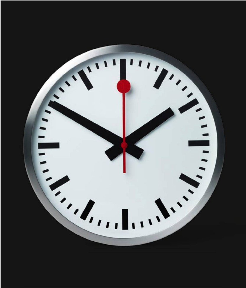
The Swiss engineer Hans Hilfiker invented the famous railway station clock, powered by electricity and synchronised every minute via the telephone line, in 1944.