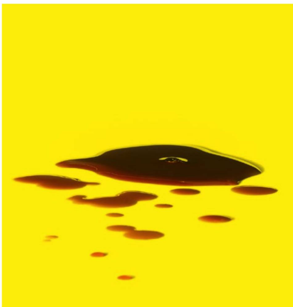
Having originally focussed on instant soups, Julius Maggi from Frauenfeld invented liquid seasoning in 1886.