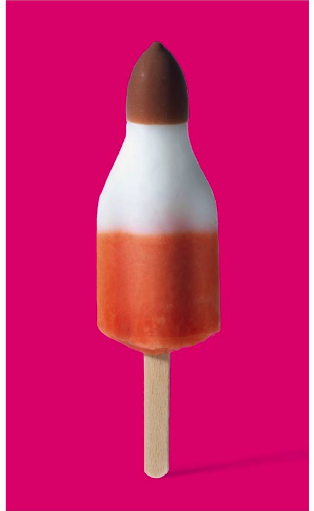
“Die Rakete” (The Rocket) – the classic Swiss ice lolly – was created after the first moon landing in 1969 and around eight million are still sold each year.