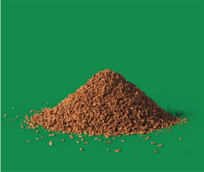
Instant coffee in powder form is a Swiss invention. Nestlé launched the first coffee in a tin in 1938.