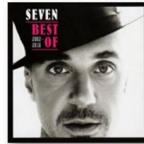
SEVEN: "BEST OF 2002-2016", SONY MUSIC

His soft but equally cool look is familiar to the Swiss, as is his passionate but controlled voice. Seven has been influential in Swiss soul music for years, an equally impressive and contradictory figure, always likeable but somehow unapproachable and impenetrable. For some his brand of soul is movingly beautiful, for others it is too clean-cut and simply too Swiss.