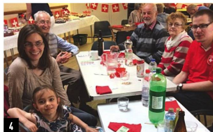
Bockwurst and tea