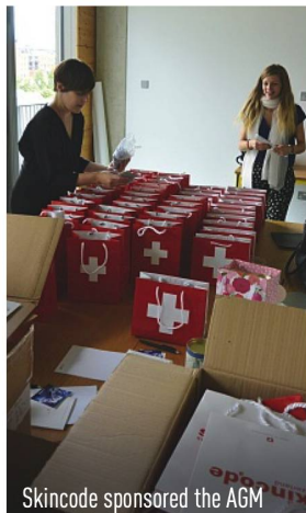
Skincode sponsored the AGM