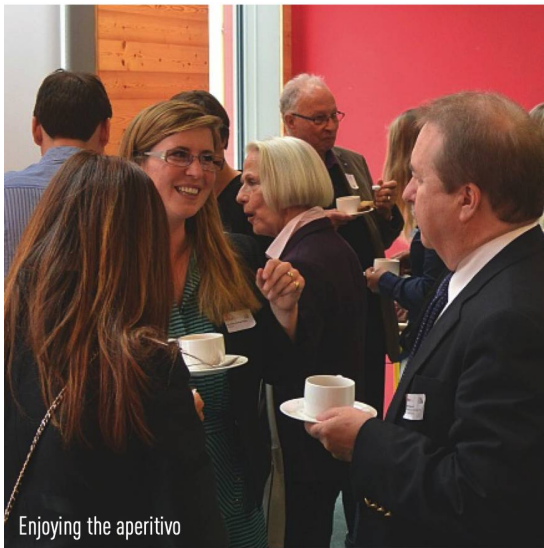
Enjoying the aperitivo