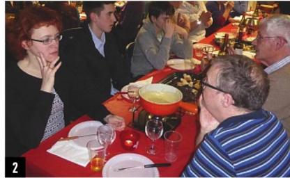
Enjoying Swiss food