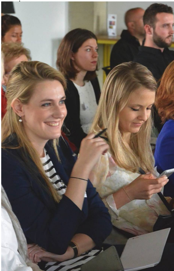
Candidates waiting for the result