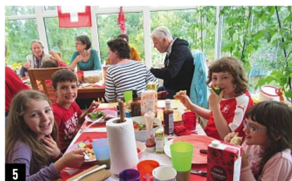
Some young Swiss members