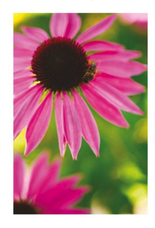
Flowering Echinacea Purpurea