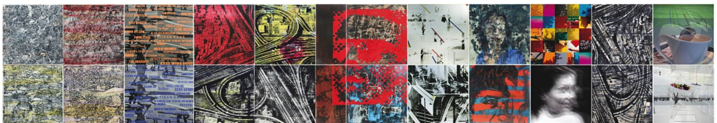
Reflexorama fries. Variety of media, 122 x 720cm