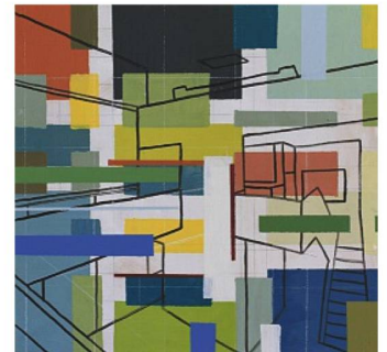
Le Corbusier, Entrance of Villa La Roche, Paris. Oil on plywood, 35 x 35cm