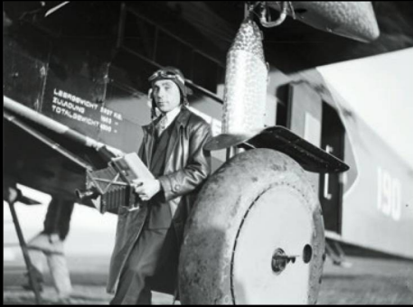
Walter Mittelholzer beside the Fokker on the Kilimanjaro flight, 15 December 1929 to 28 February 1930

Walter Mittelholzer, son of a baker from St. Gallen, did an apprenticeship as a photographer. Then he became a military and civilian pilot and ultimately a great pioneer in aviation. Throughout his life he combined flying with photography. In 1926 he flew together with a geologist, a mechanic and the writer René Gouzy by seaplane from Zurich to Cape Town. The flight, an adventurous undertaking, took 76 days. Mittelholzer documented each leg photographically – and sent the photos while underway to newspapers and magazines in Switzerland. As co-founder of Swissair in 1931, he became a national hero.