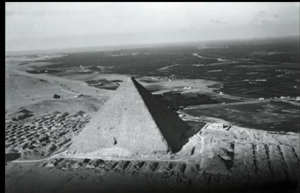
The pyramids of Gizeh, taken on the Kilimanjaro flight, 1929–30