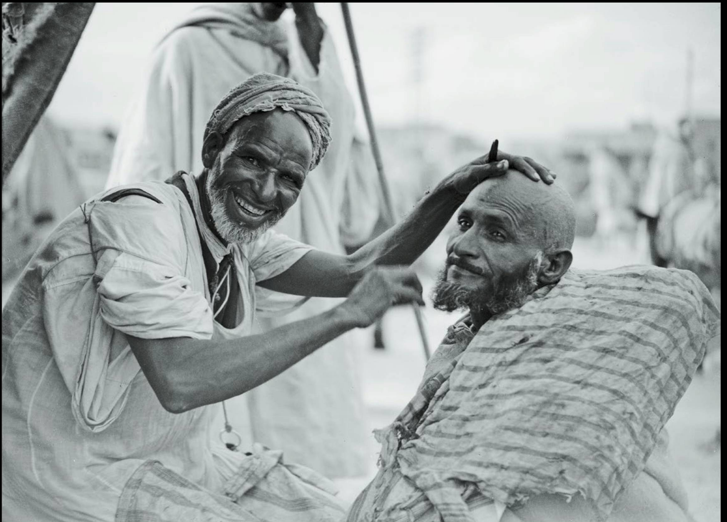
Portrait of a barber in Marrakesh, taken on the Lake Chad flight, 1930-31

The exhibition "The Flying Photographer" about Mittelholzer can be seen at the Swiss National Museum in Zurich until 7 October 2018. www.landesmuseum.ch . The ETH Library preserves the photographic legacy of Mittelholzer. More than 18,000 pictures are available online. http://ba.e-pics.ethz.ch