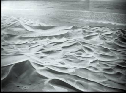
The North Face of the Eiger at a height of 3,800 metres, taken in 1919; and sand dunes of the Sahara, taken in 1930.