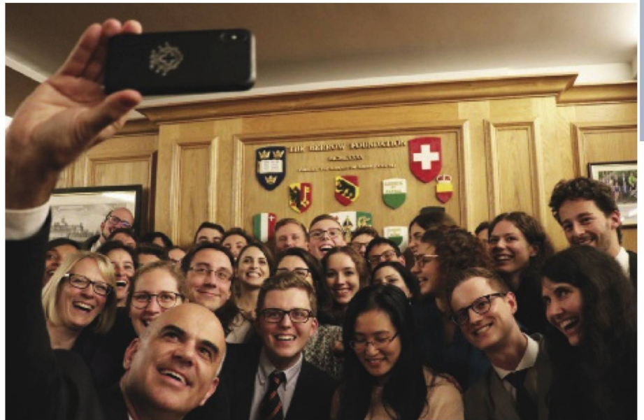
A selfie with Berset taken after the dinner in front of the «Swiss wall».

FS: A large percentage of the Swiss students in Oxford and international friends of Switzerland accepted the invitation of the Oxford University Swiss Society to give Alain Berset a warm, informal welcome to the Lincoln college MCR before a formal dinner. The Lincoln college MCR is known as the most Swiss room in Oxford, because of the