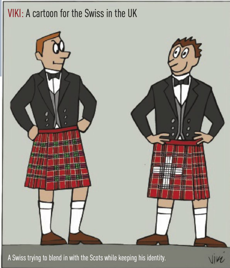
A Swiss trying to blend in with the Scots while keeping his identity.