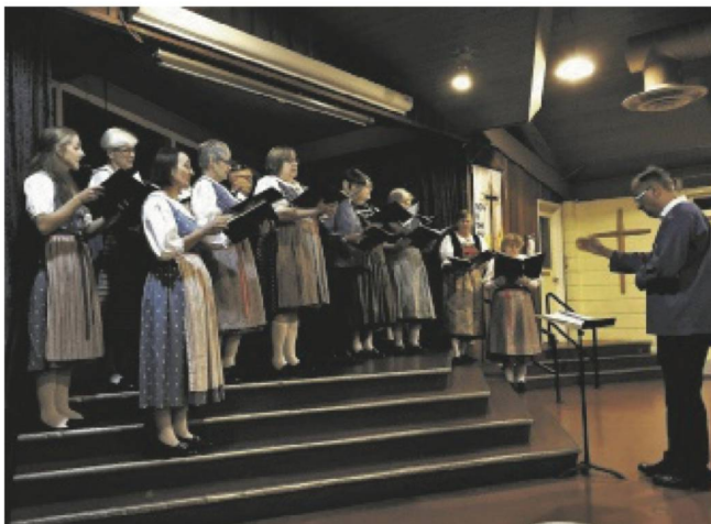
2018 Benefit concert for St. Mary the Virgin, Sapperton, New Westminster, BC

A recent Swiss study concluded that most choirs are overaged and struggle to find new members. In my opinion, the best remedy is to work with 'projects' limited in time and scope. One of our projects is to re-establish an informal men's yodeling group, this time including one or two good women yodelers.