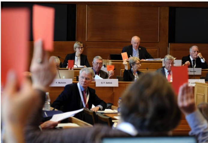
In session – the main focus of the CSA in Berne centred on the 2019 elections.

In Berne, the CSA decided that it will be making voting recommendations for the first time ever. Its objective in doing so is to take even greater account of the needs and concerns of Swiss Abroad in the forthcoming legislative period. These recommendations will be finalised at the next CSA meeting on 16 August 2019 in Montreux.