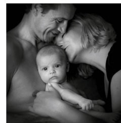
Swiss Review / May 2019 / No.3