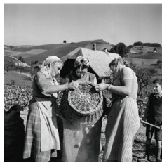
Photo Zbinden – Drei Generationen Fotografie in Schwarzenburg 1916–2016 (Photo Zbinden – Three generations of photography in Schwarzenburg 1916–2016). Stämpfli Verlag, Berne, 2019. ISBN 978-3-7277-6038-4, CHF 34.00